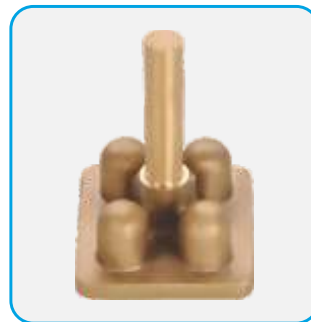
20. Four Hole Earth Point