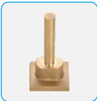
21. One Hole Earth Point