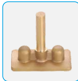
22. Two Hole Earth Point