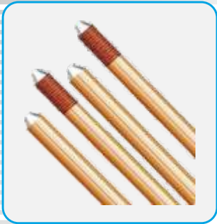
41. Copper Bonded Rod