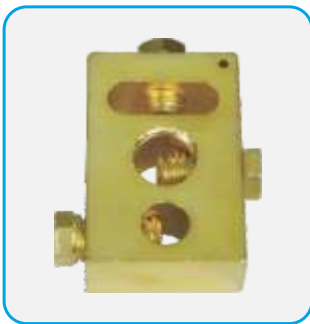
13. Earth Clamp