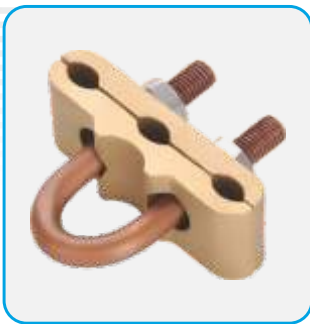
11. Heavy U Bolt Clamp